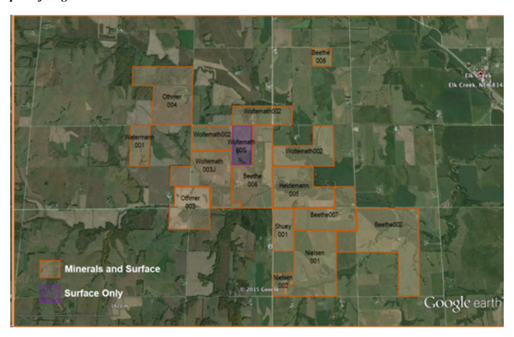
Figure 2 - Land Tenure Map as of August 2020